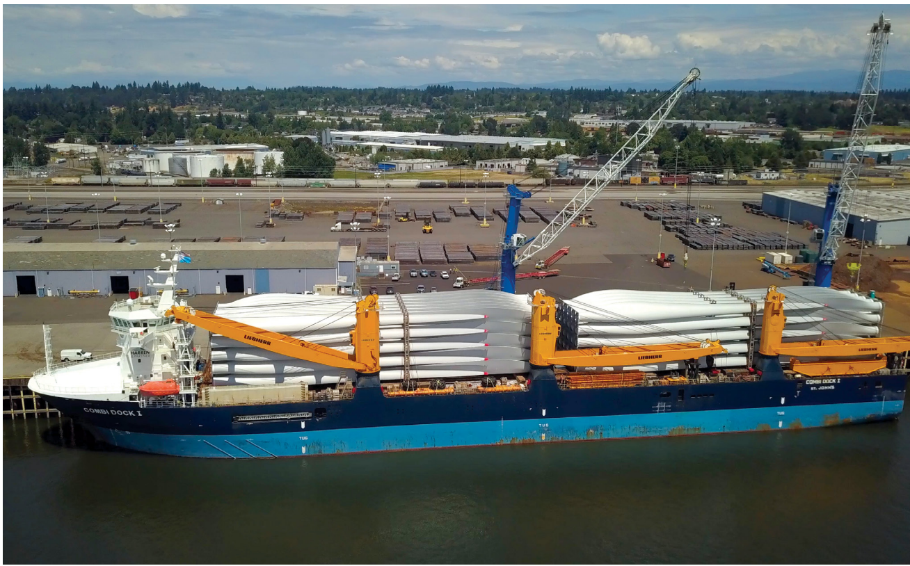
Combi Dock carrying 198 wind blades