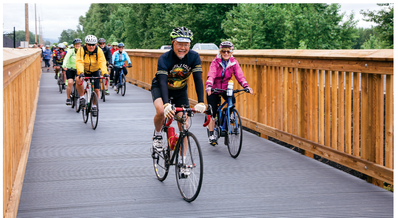
Community members celebrate opening of Trail Segment 2

and to meet unique design needs. The port is currently planning future stages of trail development and looks forward to sharing updates as progress continues.