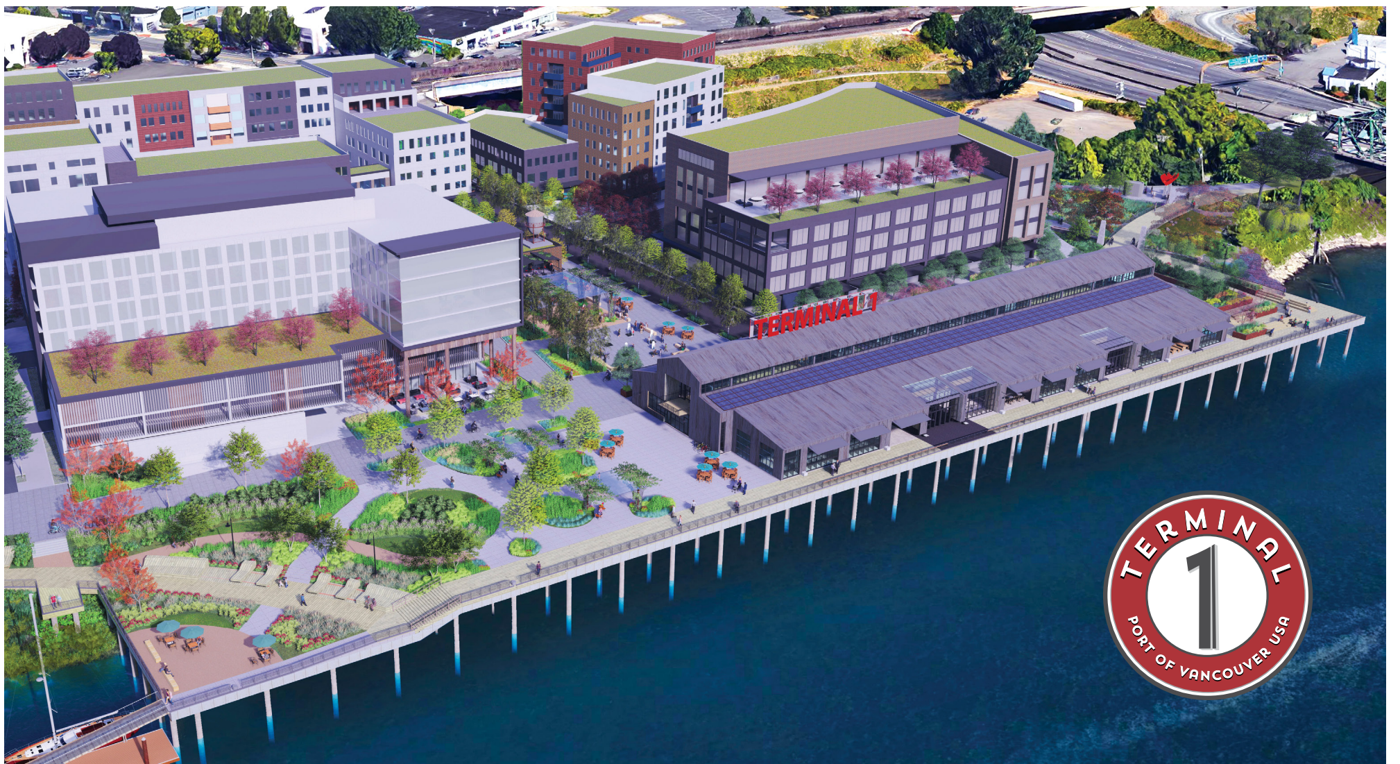
Terminal 1 rendering