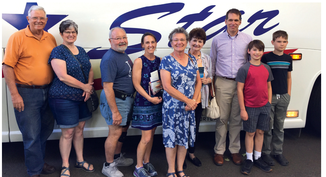
Attendees are all smiles before boarding the bus for a port tour

next year. To learn more and to sign up for early notification, visit www.portvanusa.com/community/know-your-port .