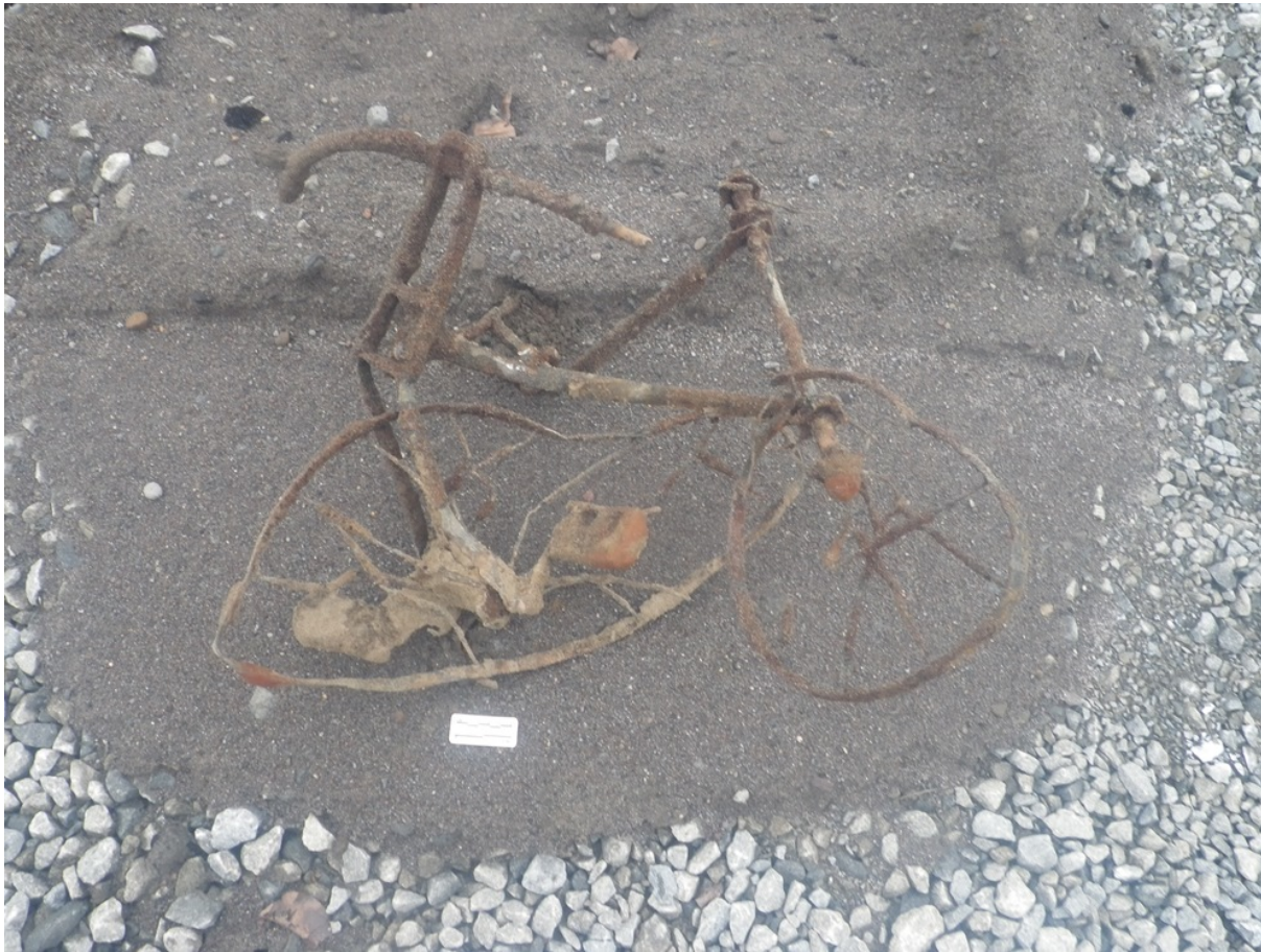
Early 20 th Century Tricycle