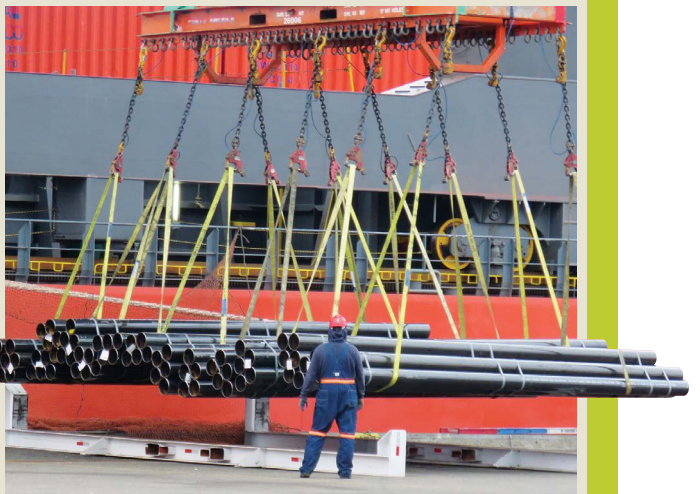
Longshore workers move steel pipe on the port's docks