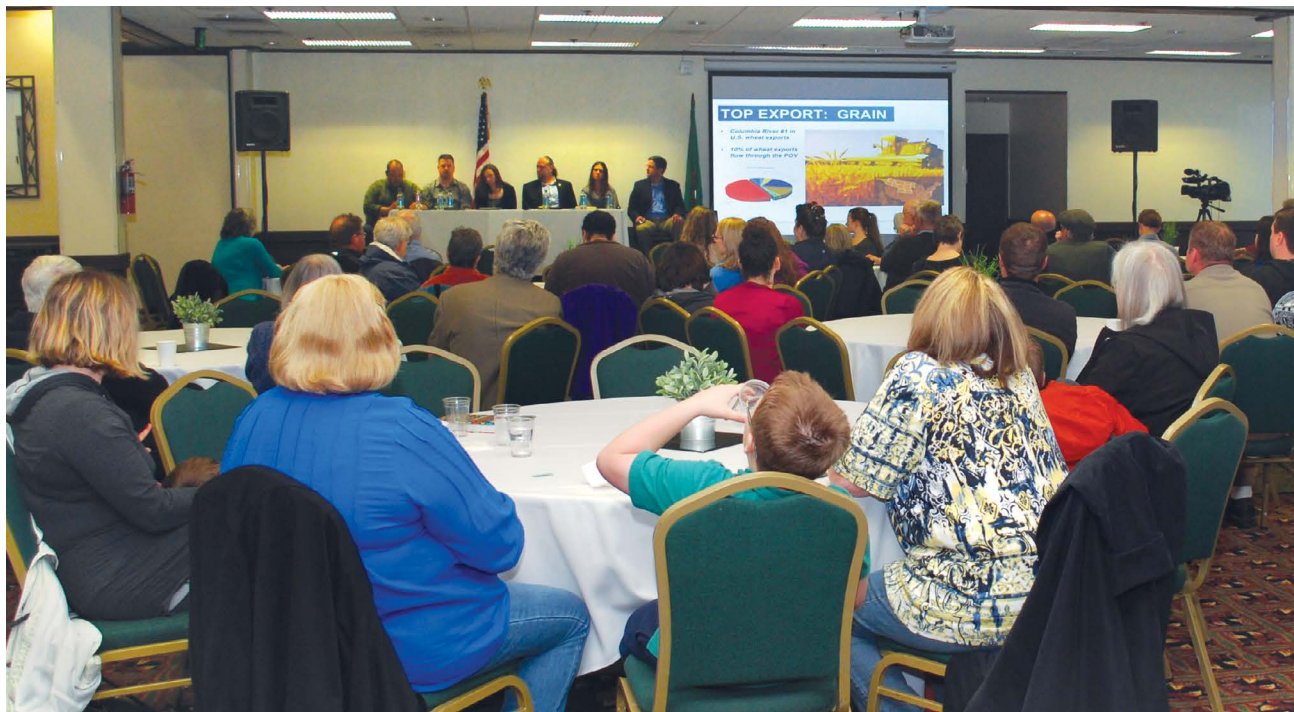
Lecture attendees hear from a panel of longshore workers during the May 3 lecture

Longshore workers from three local unions took the stage in May to showcase their fascinating and critical work moving products to and from ships, trains and trucks. Their hard work and skills ensure grain, automobiles, wind energy components, steel, fertilizer and many other commodities can move from source to market, supporting commerce and vitality in our community.