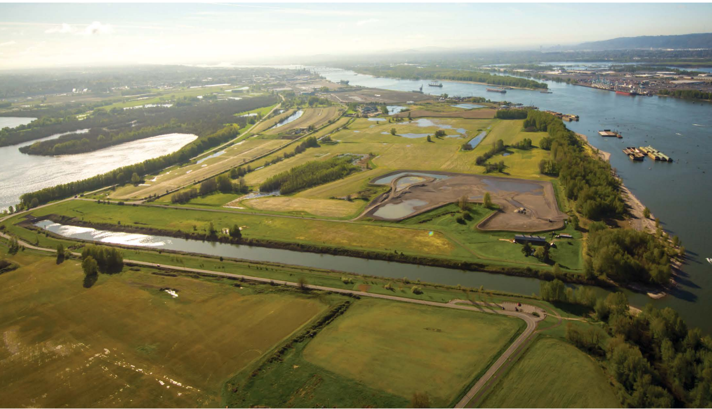
The flushing channel connects Vancouver Lake (left) and the Columbia River (right)