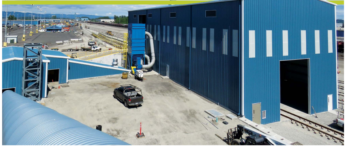
Crews are building the last two WVFA contracts, including a new bulk unloading facility for customer Kinder Morgan

Kinder Morgan moves a variety of dry bulks at the Port of Vancouver, including copper and bentonite clay. Project 7 demolishes Kinder Morgan's existing facility and builds a larger facility in a new location, with a new conveyor system connecting to the existing storage building. Constructing Kinder Morgan's bulk unloading facility in a new location allows the port to add more tracks to its rail corridor, including the pieces necessary to complete the next project in the WVFA series.