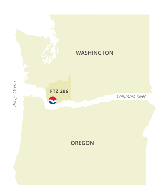
Organized under the Alternative Site Framework

As a Grantee, the Port of Vancouver USA is responsible for the organization, development, and marketing of FTZ 296 and manages it as a public benefit as part of the port's mission to promote regional economic growth through the trade sector.